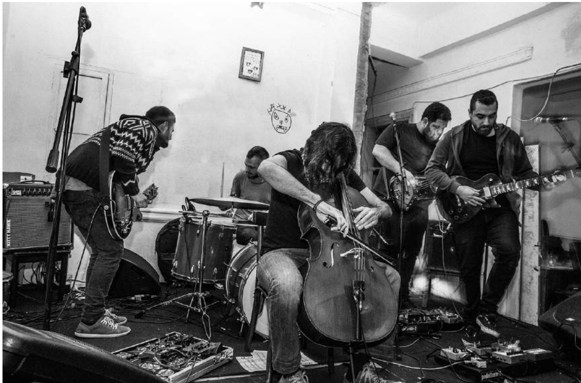
Collective Remembrance live at Boiler, Athens, Greece, february 2018