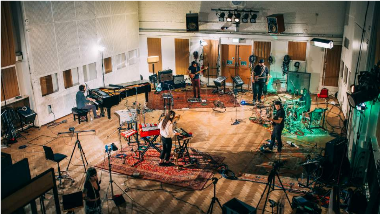
Abbey Road Studios session – June 2015