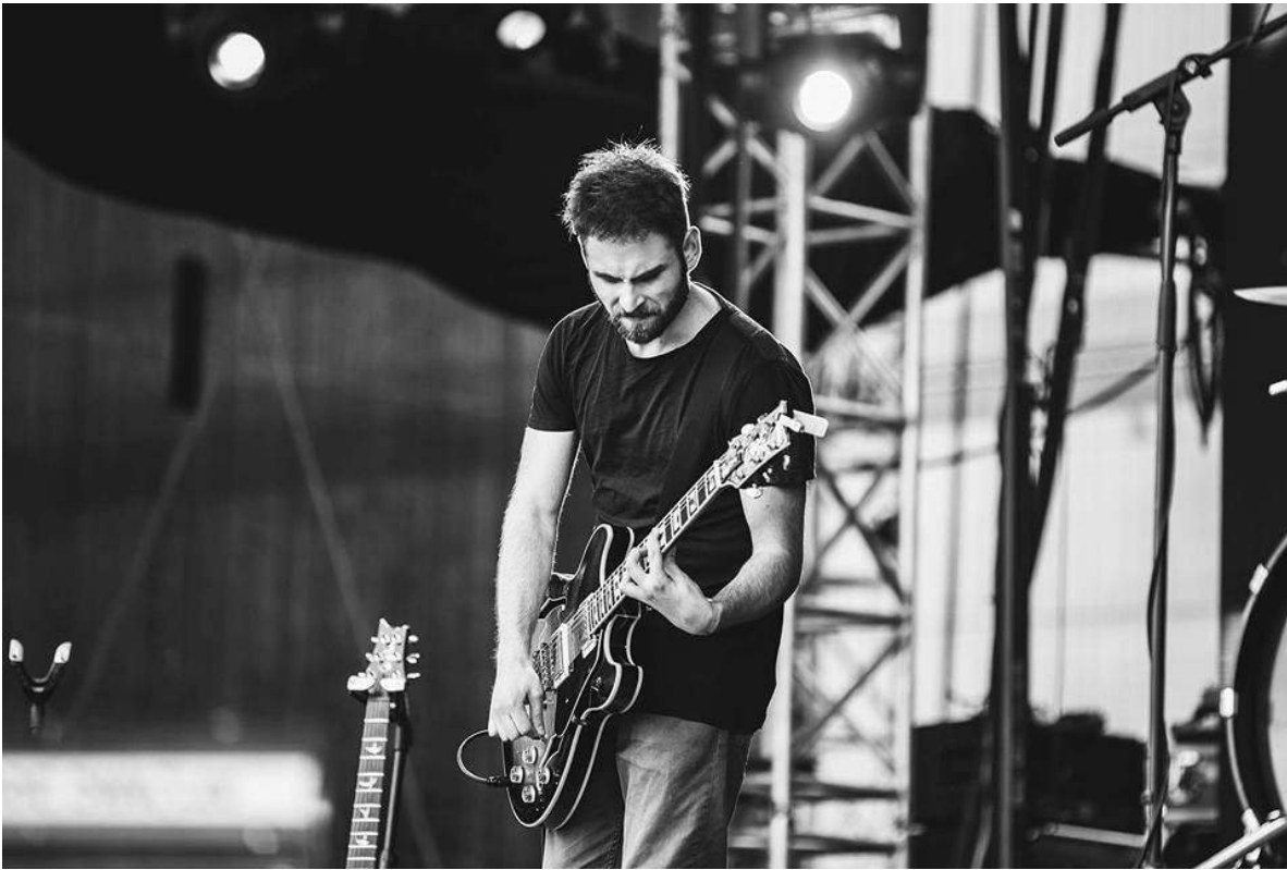
Athens Release Festival – opening for Sigur Ros, July 2016