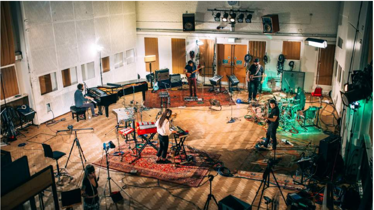
Abbey Road Studios session – June 2015